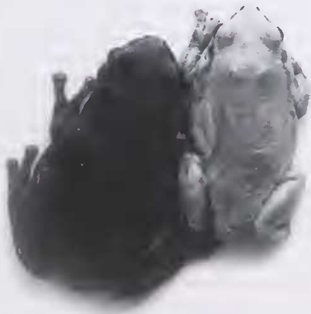
Figure 1 Light-adapted (right; chromatophore index = 2) and dark-adapted (left; chromatophore index = 4) desert tree frogs, Litoria rubella .

A dark-background and a light-background adapted frog were sacrificed, and their dorsal skin removed and placed in a diffuse reflectance accessory of a Varian dual-beam spectrophotometer (DMS-80), and the reflectance of the skin determined for wavelengths from 200 to 900 nm.